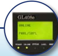
Large LCD Display Panel